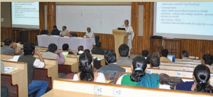
A view of the on going conference