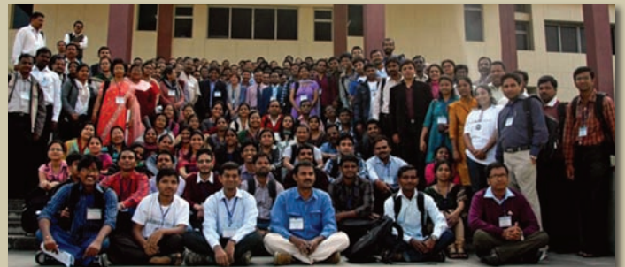
Participants of ICANN-2011