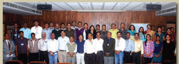
Participants of short term course on Hydroelectric power development

A short term course on 'Hydroelectric power development' was organised during 5-9 December 2011 under QIP. About 25 participants from various engineering colleges of India attended the course.