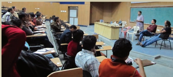
A YETI 2011 session in progress

ecologists and conservation biologists, early in their career, to present and discuss their work, exchange ideas, and establish collaborations with their peers and contemporaries across the country.