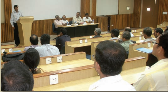
A scene of the national workshop on use and deployment of web and video courses