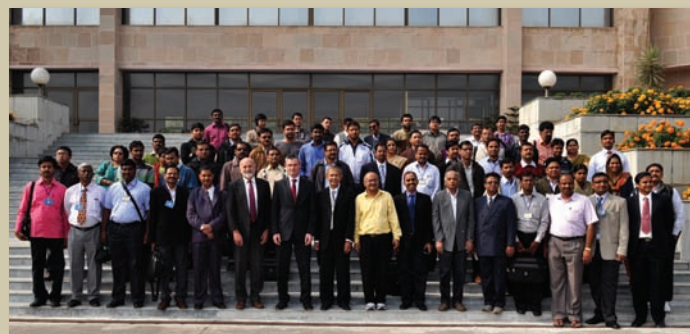
Participants of the ICMM 2011

The International Conference on Computational Methods in Manufacturing (ICMM 2011) was held during 15-16 December 2011 at IIT Guwahati. The conference focussed on the latest developments in the field of computational methods applied to manufacturing and provided an excellent opportunity to exchange ideas and share knowledge in latest hard and soft computing methods that could be applied in the modelling and optimisation of manufacturing processes. The conference put major focus on industrial application of academic knowledge. In addition to contributory papers, the