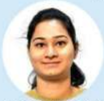
SHEHNAZDEEP Civil Engineering