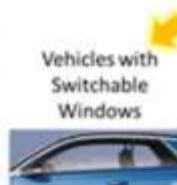
Vehicles with Switchable Windows