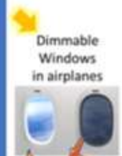
Dimmable Windows in airplanes